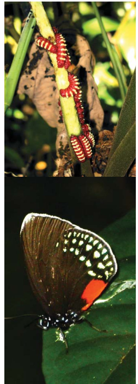
Fig. 6. Larvae (A) and adult (B) of Eumaeus godartii , an insect predator of Zamia species throughout Panama.