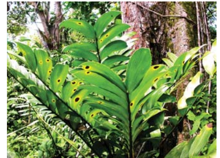
Fig. 5. Leaf spot fungus, possibly Mycocleptodiscus indicus , on a plant at Wizard Beach.

We were elated over our “find” until we came upon the second sign of cycad destruction. A large house was in the