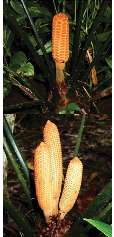
Fig. 3. Female (A) and male (B) cones of Zamia neurophyllidia at Wizard Beach.

discovered and named more than 150 years ago, it is remarkable that it is still