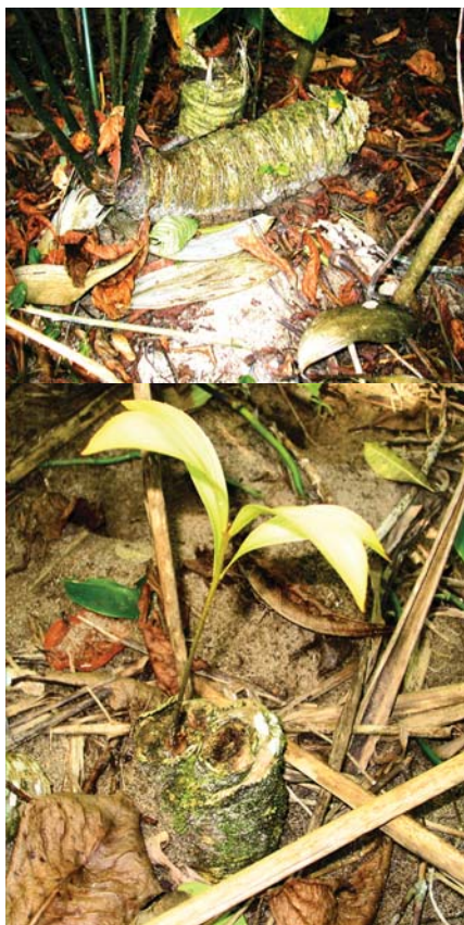
Fig. 8. Examples of the regenerative abilities of Zamia neurophyllidia at Wizard Beach in response to human-induced damage: A) cut rerooting in the sand, and B) cut trunk base resprouting leaves.

home, but rather the home of a person with money—and lots of it! The cycads had been cleared throughout the property, and we strolled by in utter silence as we were slammed with a huge dose of reality.